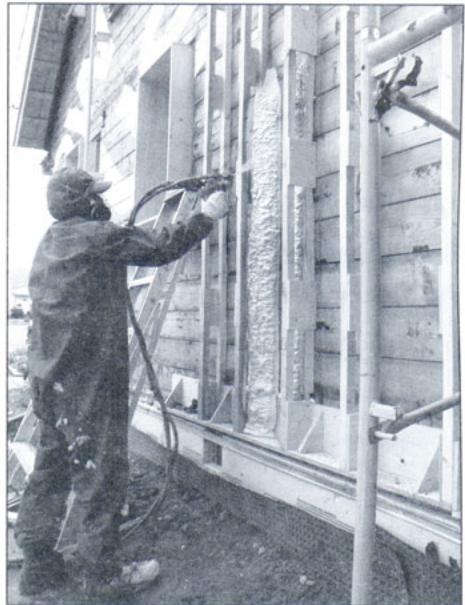
Figure 2. Dimension lumber and plywood trusses screwed to the sheathing on sixteen-inch centers provide adequate insulation space and a nailing base for finish siding.

In insulating the remainder of the building shell, the team used a version of the "chainsaw retrofit" developed by the Saskatchewan Research Council's Dr. Rob Dumont during the 1980s. After stripping the aluminum siding and metal roofing to expose the horizontal 7/8-inch board sheathing, the team fabricated six-inch-deep Larsen trusses from parallel lengths of 2 x 2 joined with 3/8" plywood webs and screwed them through the sheathing and into the exterior wall studs (see Figure 2). Window openings were extended with 3/4-inch plywood frames screwed to the faces of the original rough openings, and the prepared walls were sprayed with about 5 inches of BASF Walltite Eco medium-density polyurethane foam.