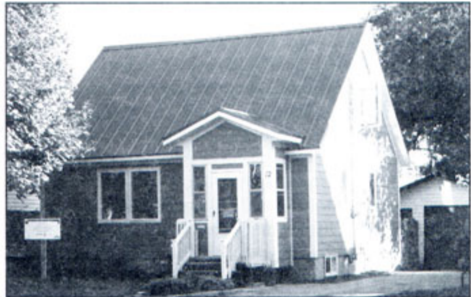
Figure 1. As seen from the street, near-zero-energy Now House is all but indistinguishable from other modest 60-year-old houses in its Toronto neighborhood.

The Now House project was conceived by the Toronto organization Work Worth Doing, a collaborative group of sustainable building experts and homeowners led by Toronto design consultant Lorraine Gauthier. Its goal, according to Gauthier, was to apply sustainable building practices to mid- and lower-income housing. "When people see these kinds of ideas in a house they're familiar with they can visualize them in their own homes," she says. "In an expensive new model home they just seem completely out of reach."