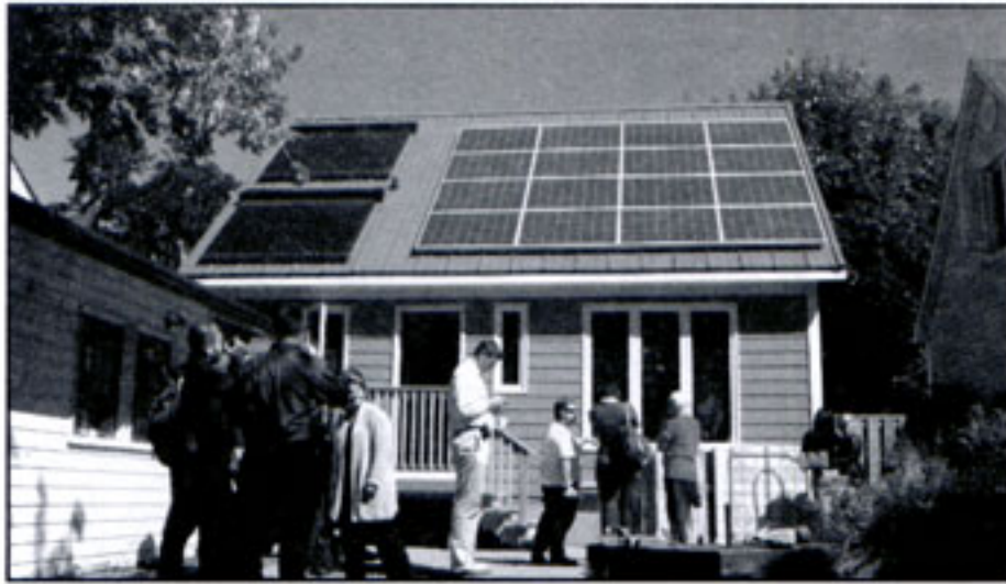
Figure 4. All existing windows were replaced with low-e argon-filled units. Only one – the three-paned south facing window visible at right – was enlarged for added passive solar gain. Heat-mirror triple glazing was used in one west-facing window subject to prolonged late afternoon sun.

But, while it's expected to fall short of zero-energy performance, the Now House should achieve zero energy "cost", thanks to a very attractive rate structure available to renewable electricity producers in Ontario.